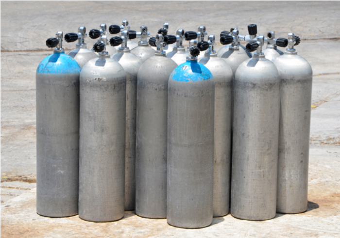
FIGURE 4: Digital pressure sensors play several important roles in pressurized air and medical gas distribution networks and enable better system conditioning and monitoring.

This allows system developers to get closer to the ideal working conditions for the application. Using digital pressure sensors in these systems could enable the creation of custom dashboards that monitor the fullness of gas bottles and their locations, allowing operators to more efficiently troubleshoot and maintain the system.