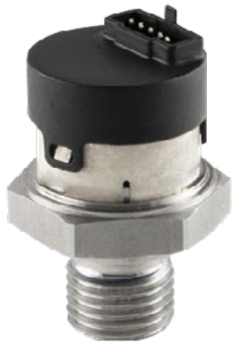
FIGURE 2: Digital pressure sensors like Sensata’s PTE7300 feature additional electronics onboard that suppress noise from sources such as WiFi, Bluetooth, and GSM and ISM bands. In addition, they feature low power consumption for battery operation, fast response time, increased sensor diagnostics, and sensor communication integrity check using cyclic redundancy check (CRC).

Digital sensors provide the option of including CRC in the chip to help assure customers that they can rely on the signals. The CRC of the communication data is additional to the integrity check of the internal chip memory and allows users to validate 100% of the sensor output, providing an extra measure of data protection for the sensor. CRC features are ideal for pressure sensor applications in noisy environments, like when installed close to a transmitter in a cloud-based system. In such a scenario, there is an increased risk of noise interfering with the sensor’s chip and producing a bit flip which could alter the communication message. The CRC on the memory integrity will protect the internal memory from such corruption and repair if needed. Likewise, some digital sensors also provide an additional CRC on the data communication which indicates corruption of data transferred between the sensor and controller and could trigger another attempt to assess a proper sensor readout. In some cases, end users circumvent this by interleaving the communication with the sensor with the external communication (for example to the cloud, a gateway or a controller). CRC simplifies this process and gives the designer more flexibility. In addition to data validity checking, some manufacturers include more electronics that suppress noise from sources such as WiFi, Bluetooth and GSM and ISM bands, further protecting data validity.